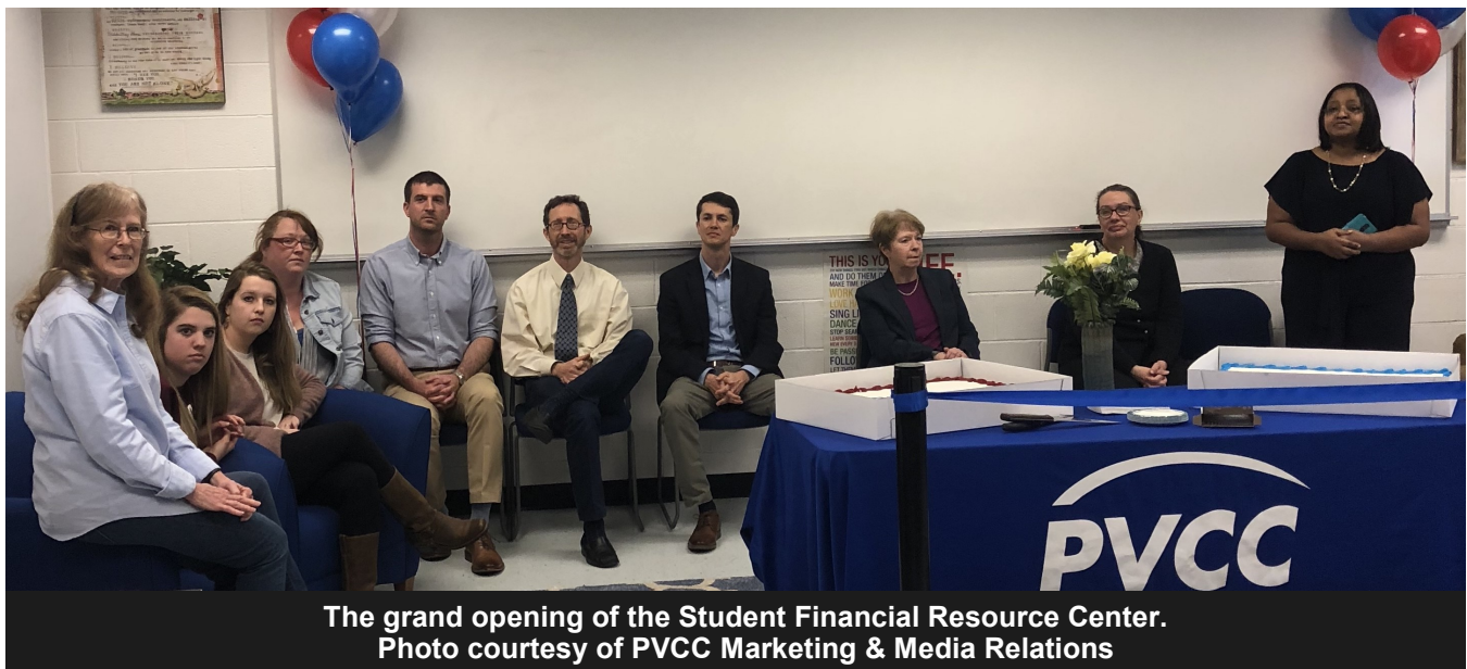
The grand opening of the Student Financial Resource Center.

The Student Financial Resource Center is always seeking volunteers to help out with their clothing stock and food pantry. If anyone is interested in helping their fellow students, reach out to Amanda Key in Room M131 or by emailing her at akey@pvcc.edu . There are many resources available at PVCC and in the community that strive to help students be successful, but students must always initiate by seeking assistance.