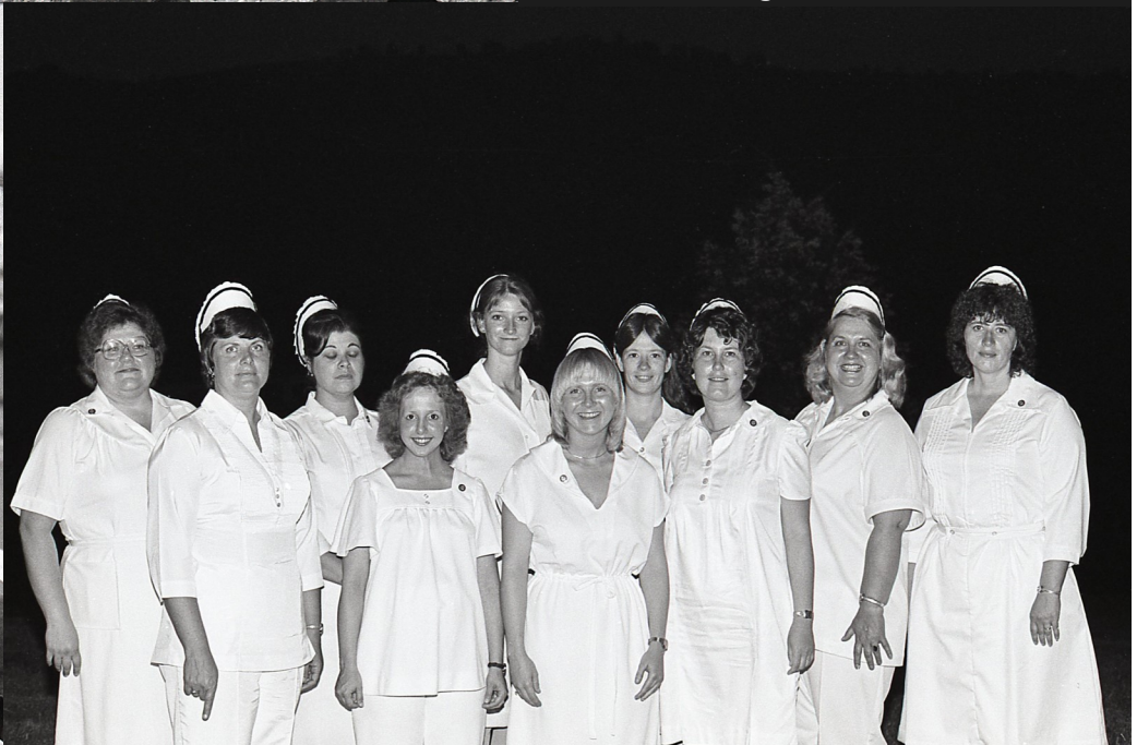
1970s outdoor class pictured in the upper left. 1980s Ceramics class pictured on the left. 1970s Nursing graduates pictured on the right.