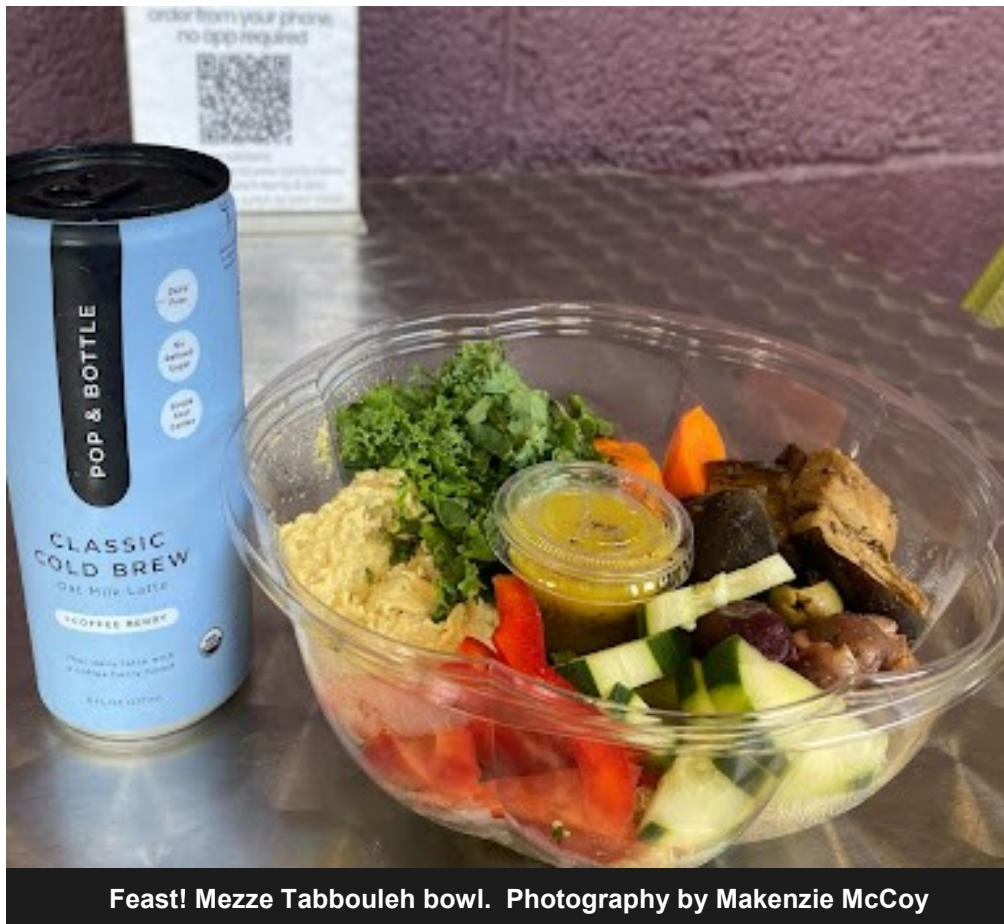
Feast! Mezze Tabbouleh bowl.

It was a great experience to both try and learn more from and about Feast!. My mom is a part of their staff team, so I always hear so much about it, but experiencing the food and the environment on my own was lovely.