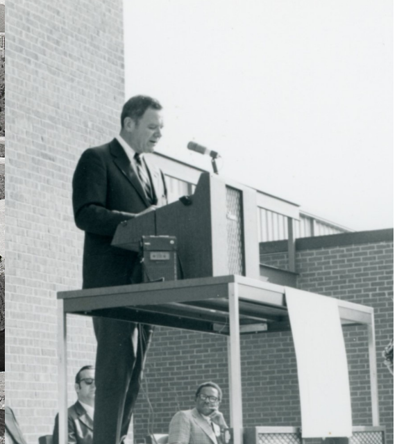
1973 original campus sign pictured at the top of the page. Main Building dedication pictured above.