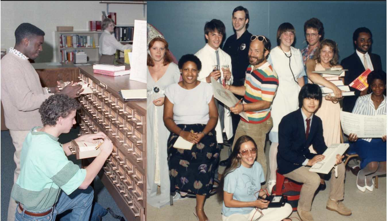
1980s picture of students in the library pictured on the left. 1980s student group pictured on the right.