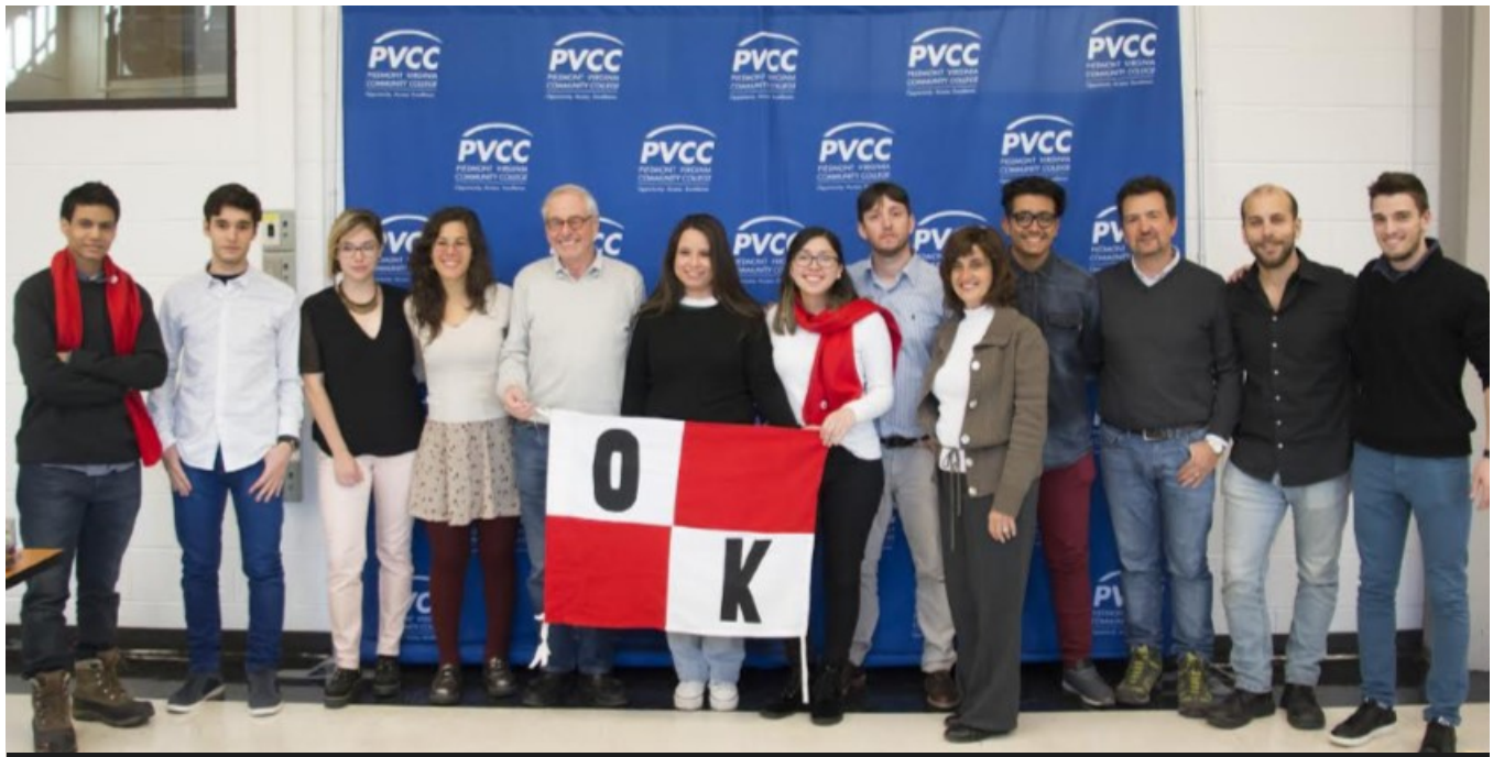
Group of Otto Krause students visiting PVCC.