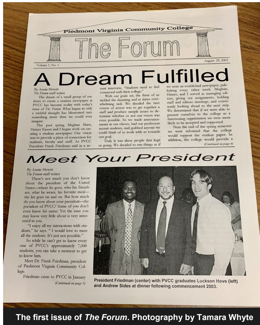
The first issue of The Forum . Photography by Tamara Whyte

Our purpose is to create a sense of community within the college by providing up-to-date and relevant information and a forum for the exchange of views. Our goals are [to] provide you with tools in your education career, acquaint you with multiple information sources, and of course give students the opportunity to explore a journalism career path.