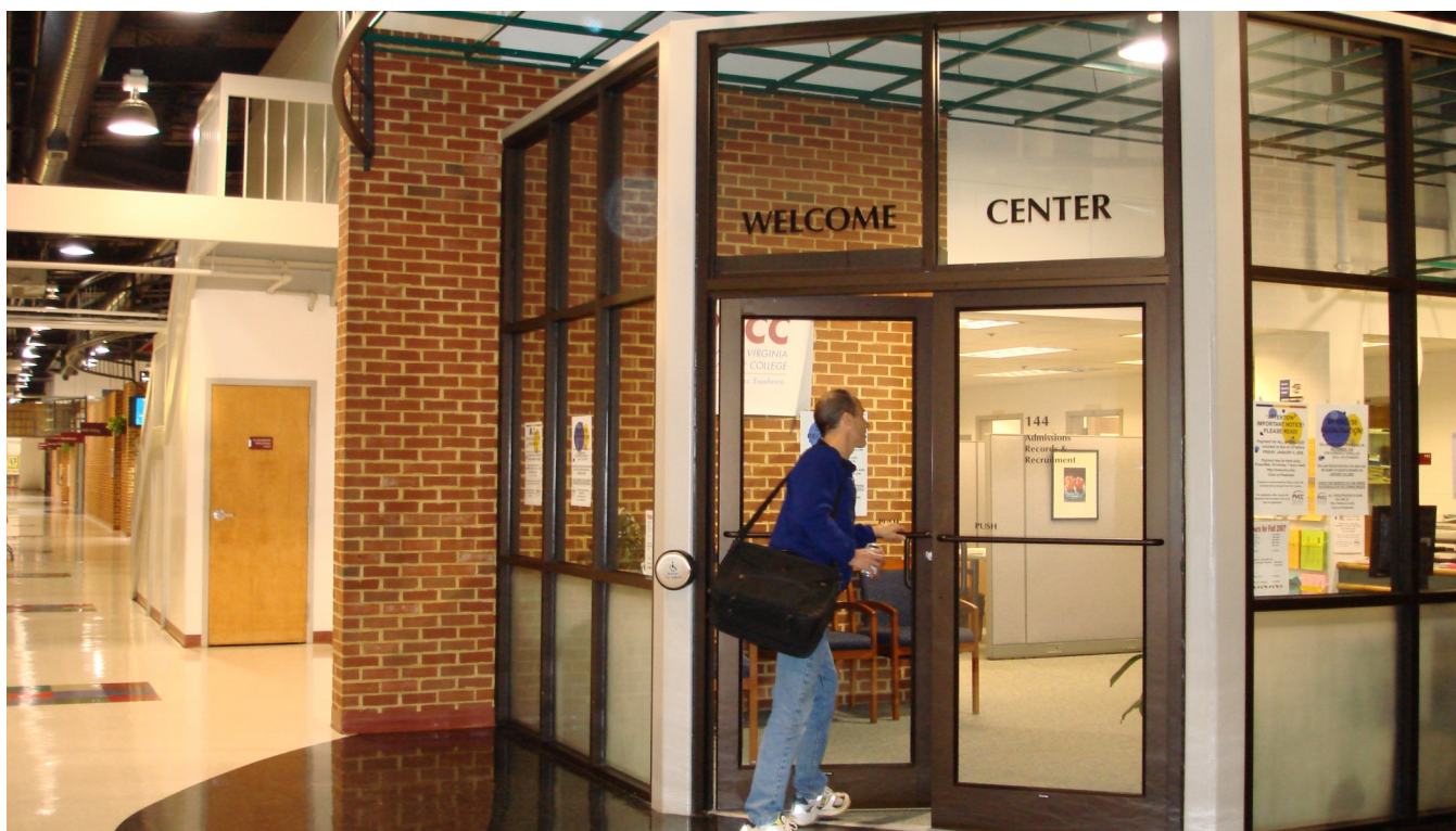
Admissions and Advising center opening.

The Center is open Monday through Thursday from 8 a.m. to 6 p.m. and on Fridays from 8 a.m. to 5 p.m.