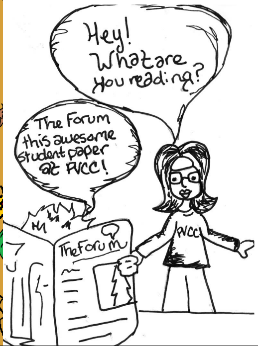
2015 Comic by Bridgette Lively