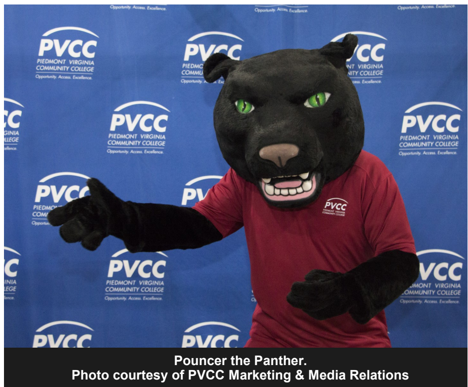
Pouncer the Panther.

The Panther Mascot Event was filled with excitement and laughs throughout, with endless interactions between the mascot and students and faculty. Pictures to high fives, the Panther gives PVCC spirit a thumbs up.