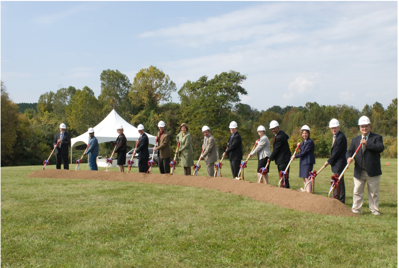
Groundbreaking for the Science Building in 2008 pictured above.