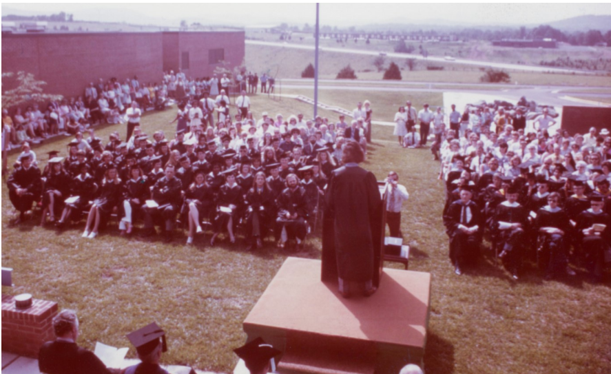
The first PVCC commencement ceremony, 1974.

To continue the celebration, this issue of The Forum includes previous published articles, highlighting the history of the college.