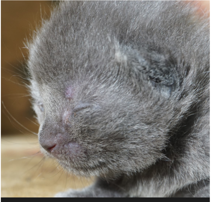
Sprocket, one of the frequently featured pets on Zoom.

after class giving a mini show and tell on their animals. I am not the only one who enjoys an after class not-so-national geographic special on quarantined pets – Jude Bolick (and her ferrets) enjoy this opportunity too.