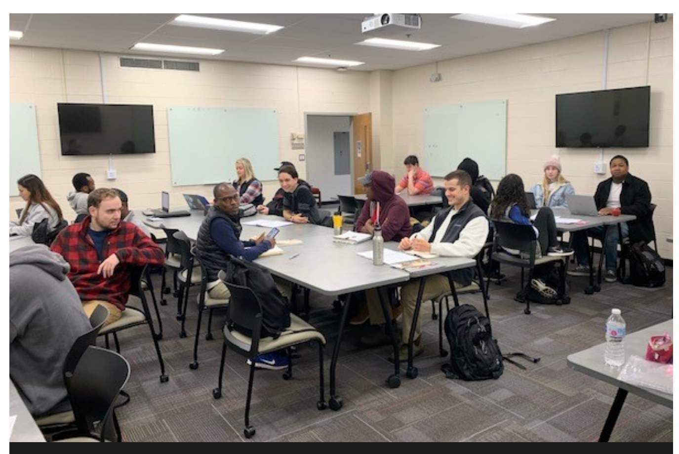
SOC 266.