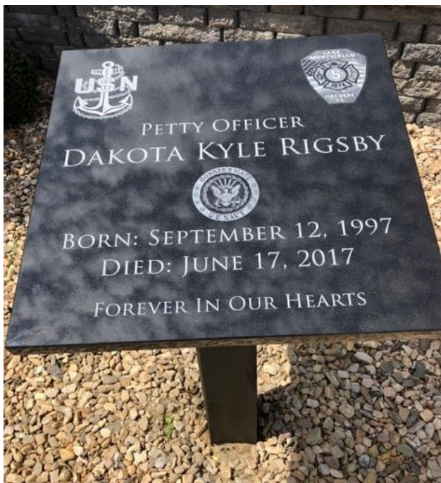
Plaque outside post office.