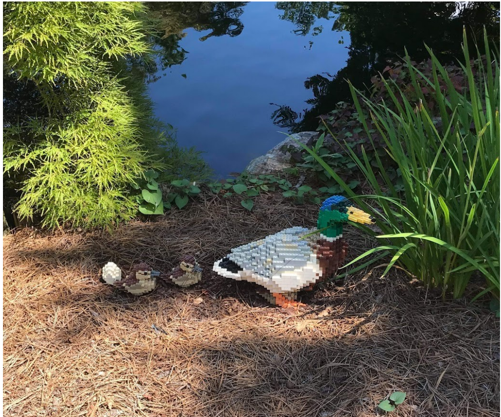
LEGO mother duck with ducklings in tow.