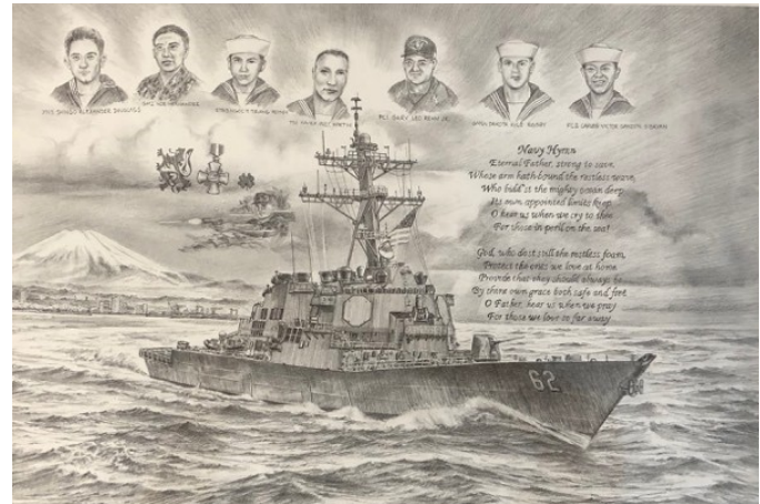
Artwork commemorating fallen sailors.