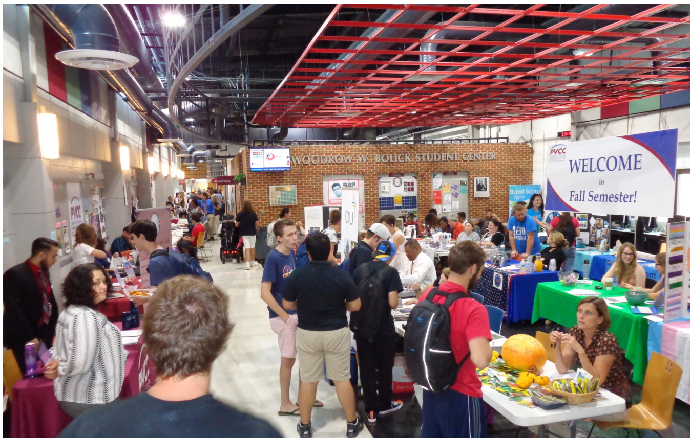
PVCC Club Day Fall 2016.

Help keep PVCC colorful. Be the color and don't be shy to join a club. If it interests you, join it. Go to a meeting and be active. Be a spark of color in PVCC's cultural and social diversity.