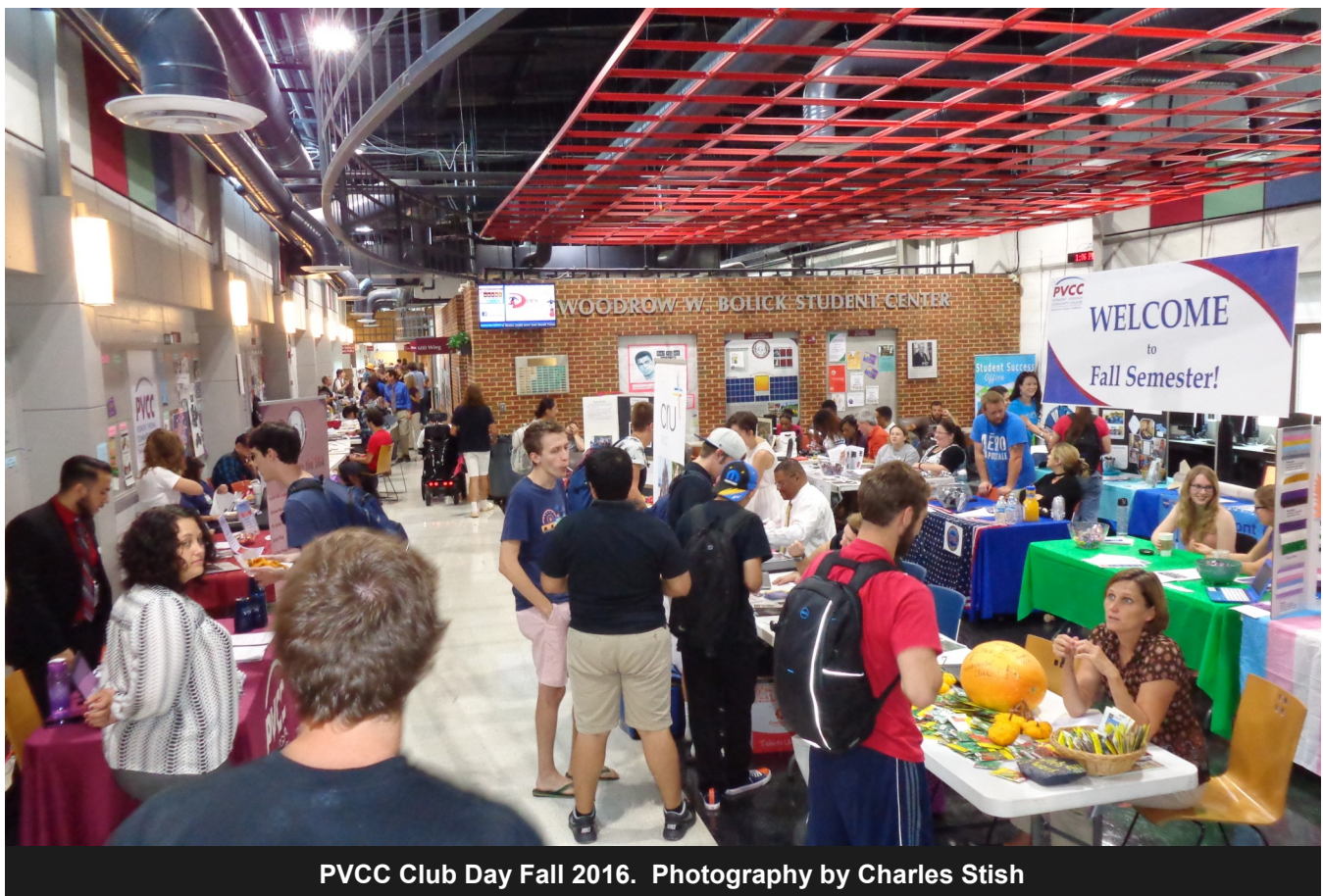
PVCC Club Day Fall 2016.

Help keep PVCC colorful. Be the color and don't be shy to join a club. If it interests you, join it. Go to a meeting and be active. Be a spark of color in PVCC's cultural and social diversity.