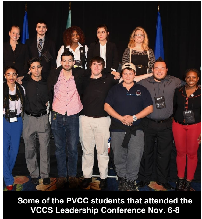
Some of the PVCC students that attended the VCCS Leadership Conference Nov. 6-8