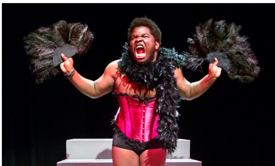
Rocky Horror at PVCC