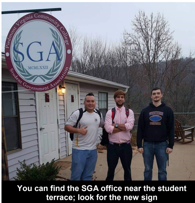
You can find the SGA office near the student terrace; look for the new sign

The SGA along with any clubs willing to help can participate with us keeping our campus beautiful!